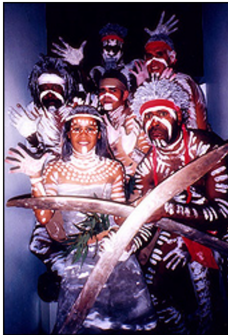
Descendance Aboriginal & Torres Strait Islander Dance Theatre will be performing at the NY Hemsley as part of the IFIP Conference. descendance.com.au

In preparation for IFIP's Annual Conference, that will be held at the Ford Foundation from May 16-17, 2006. IFIP is proud to present the Descendance Aboriginal & Torres Strait Islander Dance Theatre as the cultural event on the evening of May 16th. Descendance has received recognition on the international arena when they received the first prize in the dance category for the World Culture Opens first cultural style Olympics in South Korea. Descendance has also completed hundreds of shows across Europe, America and Asia, and participated in major world events at the Sydney Olympics in 2000 and is providing Australia and the world the finest in traditional and contemporary indigenous culture and music.