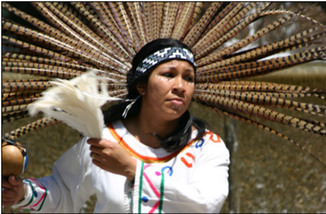
Cantonal, an Aztec dance group blessing the Levi Strauss Plaza with Danza Cuauhtona - a traditional, spiritual Indigenous dance that originated in Mexico.

All of these exciting events prove that now is the perfect time to join our expanding network of International Funders for Indigenous Peoples. Become a paid member today to take advantage of our unique services, like our newly implemented Members-Only Listserv and Members Forum. Click here for information on how to become a member and please note that the last day for submission of articles for the Spring/Summer newsletter is due July 1, 2007.