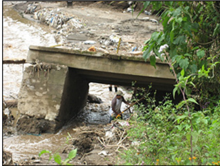
Bridge Demolished Due to Hurricane Stan

By now, I'm sure that many of you have heard reports of the devastating disaster that hit dozens of Mayan Indian communities in Guatemala. Hurricane Stan, Central America's worst hurricane in more than a century, slammed into Guatemala in early October and uprooted tens of thousands of Indigenous peoples. According to initial estimates, Stan buried hundreds of people under mud in the remote communities of Panabaj, Santiago Atitlan, San Marcos, Quetzaltenango, Escuintla, and Sacatepequez. Nearly 657 people are presumed dead, 99 are seriously injured, 577 are missing, 120,000 are displaced, and more than 200,000 are severely affected due to damaged roads, houses, bridges, businesses. To compound the matter, relief workers are also seriously worried about the growing hunger and the possible outbreak of infectious disease. For recent article on the growing concern, see news.bbc.co.uk/2/hi/americas/4426240.stm