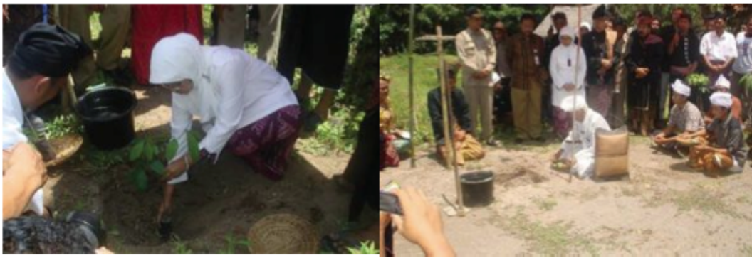
Nyampang Ritual is the procession before the tree planting is started with the wish that trees will grow and reproduce in this customary forest