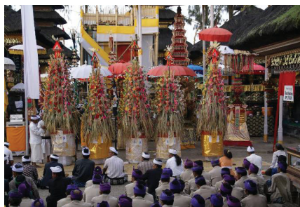
Offerings to the goddess (Pula Kerti) in the innermost sanctum of the temple Pura Ulun Danu Batur.