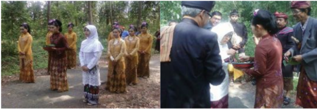
Welcoming honored guests. In the background is the Reban Bela customary forest.