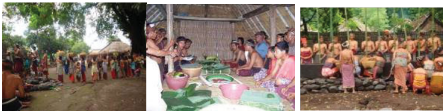
Maulid Adat: celebration of the birth of Prophet

The majority of the community converted to Islam, known as Wetu Telu. The community are still holding numerous ritual ceremonies, such as: Maulid Adat - the commemoration of the birth of the Prophet (held yearly), Ngaponin - the purification ceremony for traditional weapons (held every 2 years), Lebaran Adat - the traditional led ceremony, Asuh Prusa .