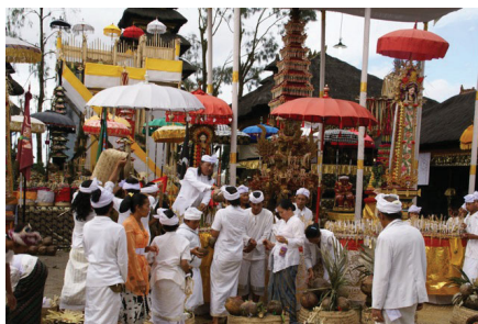
Preparing the "pula kerti" (gifts of nature and the gods) for an offering of thanks