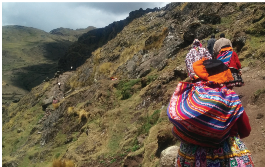
Quechua woman, member of the Association of the Communities of the Potato Park, leads the path high up in the Andes Mountains of Peru.