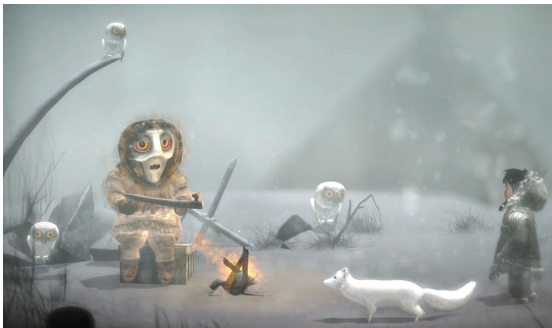
Screenshot from the video game Owlman, a Cook Inlet Tribal Council initiative.

Rasmuson Foundation also uses impact investing as part of its programs. One example was a $1 million program-related investment (PRI) in the Cook Inlet Tribal Council's (CITC) video game initiative. Rasmuson Foundation, the largest private foundation in Alaska, had maintained a traditional philanthropic relationship with the Native organization for nearly two decades, funding such initiatives as capital support for CITC's service centers. "Through this PRI the foundation saw the potential power of video games as a way not only to create a revenue