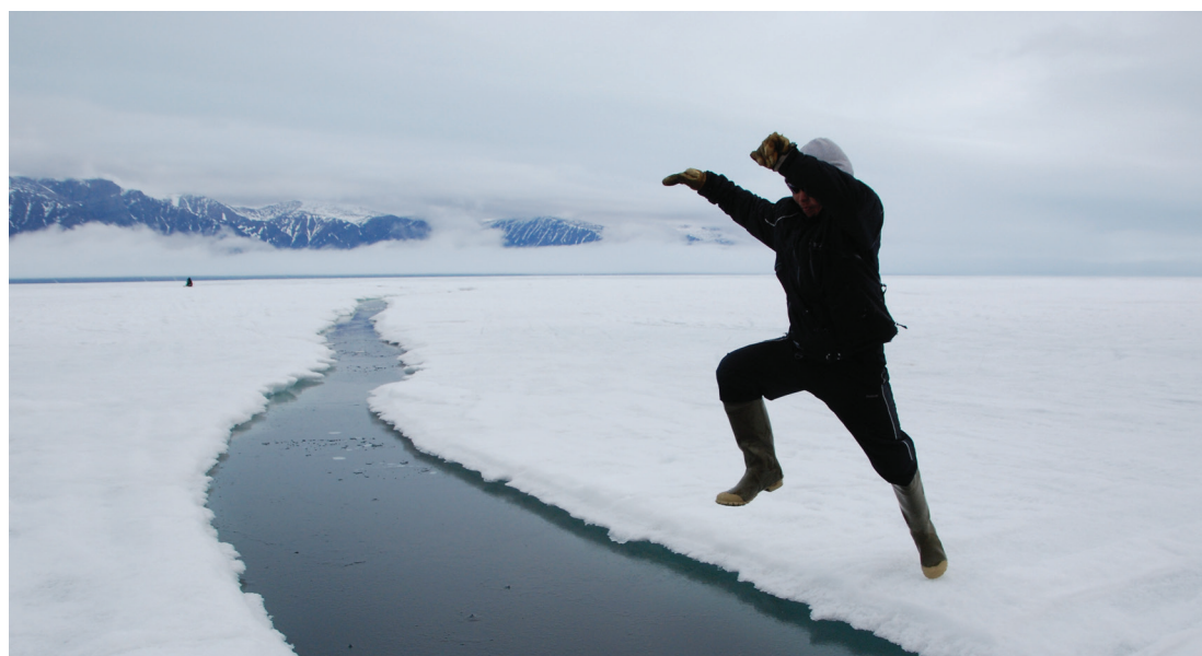
Inuk from Mittimatalik (Pond Inlet, Nunavut, Canada) jumps over lead in the sea ice en-route to the rich hunting grounds on the floe edge. Travel is increasingly dangerous and unpredictable as sea ice seasons grow shorter and New Year round shipping make conditions even more unstable. Photo by Anne Henshaw June 2015.

Some funders support indigenous peoples' travel to global meetings, such as sessions of the UN Permanent Forum on Indigenous Issues, or regional networking events, like the