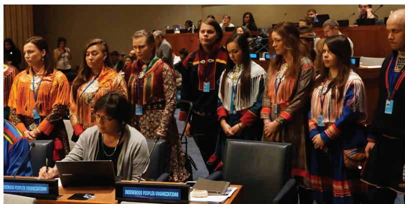
Indigenous Youth Caucus at the 2015 UN Permanent Forum on Indigenous Issues.

Those who support indigenous peoples find them invaluable partners in achieving their program goals. Environmental funders recognize that indigenous peoples live on the earth's last remaining reserves of high biodiversity. These funders, and those interested in cultural and language revitalization, support projects in indigenous communities. Others with a specific geographic focus often support indigenous partners when they comprise a majority of the population. Those who support social movements will fund organizing around indigenous rights and indigenous women, along with their participation in policymaking. In this publication, we will highlight some opportunities that indigenous peoples offer as partners with funders.