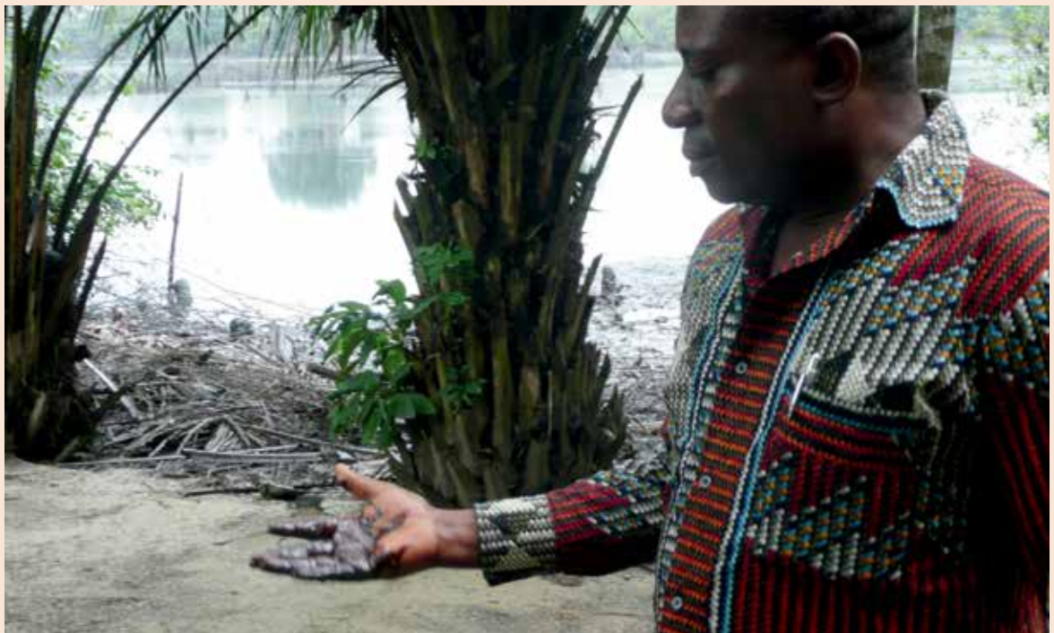
A team of Mayangna community members carrying out the field assessment phase of the Saneamiento process in their territory in the Bosawas Biosphere Reserve

In 2012, Global Greengrants Fund awarded the Ogoni Solidarity Forum that works to promote the rights of Ogoni people through education, organizing, and solidarity building, focusing on increasing Ogoni advocacy around environmental and human right, a grant of $5,000 to launch an advocacy campaign around the release of UNEP's environmental assessment of Ogoniland. The campaign's goal is to use the independent assessment to bolster their argument that an ambitious environmental restoration program is critical to the health, food security, and ultimately the survival of the Ogoni people.