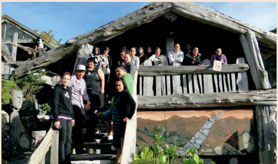
Participants at the National Rangatahi Hui/Tapu Te Ranga Marae, Wellington

Whenua (Indigenous People of Aotearoa/New Zealand) have long been concerned about the place of the Treaty of Waitangi in New Zealand's constitutional arrangements. In 2010 the National Iwi (tribes) Chairs forum set up a working group to engage with whenua around the country to develop a model Constitution for New Zealand, based on the Treaty of Waitangi, Maori tikanga (correct procedure) and kawa (protocol) and achieve the standards outlined in the UN Declaration on the Rights of Indigenous Peoples. The Constitutional Transformation Working Group planned to hold 30 hui (gatherings) around the country with tangata whenua, gaining feedback and suggestions. Over 250 hui have been held, with thousands of tangata whenua attending.