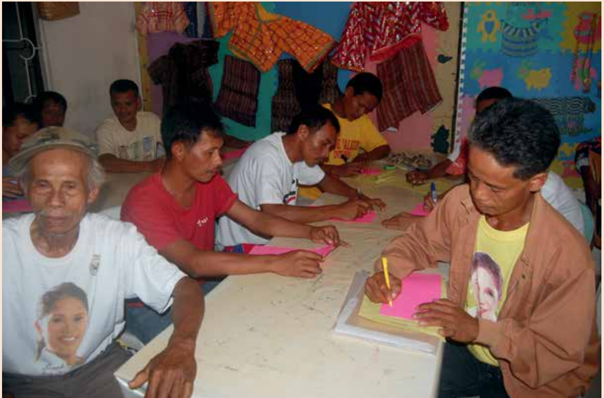
Derepuwanon Tribal Area Development Planning and Consultation workshop

The Tri-Partite MOA serves as a pre-cursor for the ongoing transition to an integrated, community-owned plantation project and facilitates private investment in oil palm for economic growth that would equally benefit both the Menuvu and Moro tribes. There is a strong need to support Indigenous peoples with kind resources, such as through facilitation or financially through small and flexible grants to pursue initiatives and push for their equal recognition in formal and local spaces. Indigenous political structures and indigenous governance need to be defined in the current contexts and in relation to the economic and political forces and movements that continuously affect them.