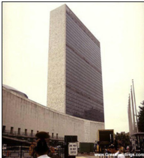
"As part of this year's conference, IFIP will organize a session at the United Nations headquarters the afternoon of May 17th."

I encourage you to submit a session proposal for this year's annual conference. Please see IFIP's "Call for Sessions" for more information and remember to submit your proposal before the February 15, 2006 deadline.