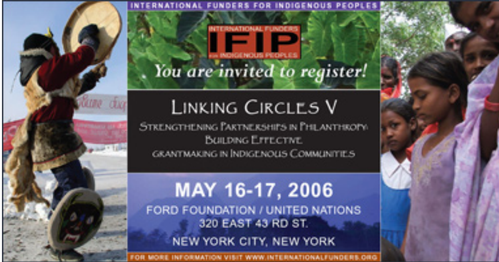
IFIP 5th Annual - register by April 14th!