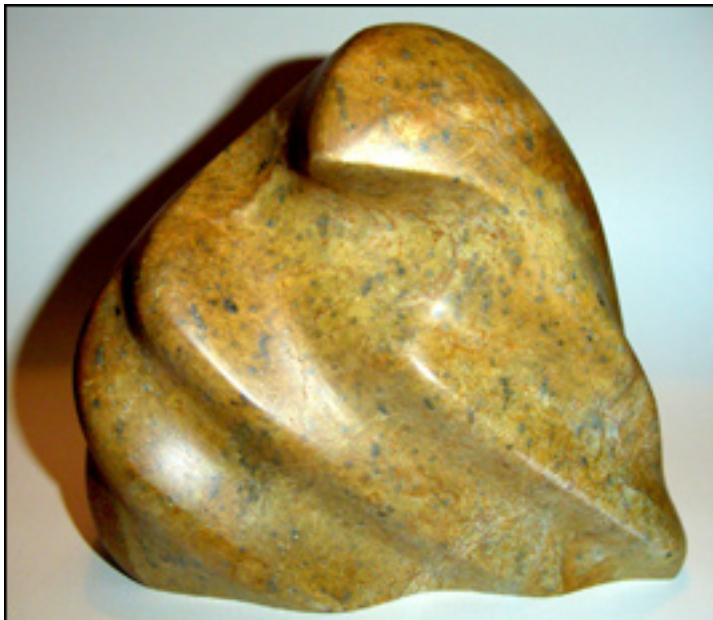
The Beautiful Brazilian Soap Stone Sculpture "Western Wind" will be awarded at IFIP's Second Annual Award ceremony on May 16 at the NY Hemsley.

IFIP has also invited The Descendance Aboriginal & Torres Strait Islander Dance Theatre , an aboriginal dance company based in Australia, to perform after the Award Presentation. Descendance has received international recognition including a first place in September 2004 at the first cultural style Olympics in Seoul, Korea, an event sponsored by UNESCO. More than 70 countries were