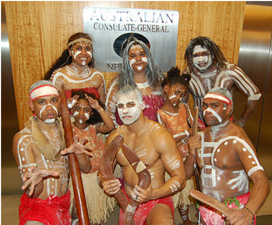
The Descendance Aboriginal & Torres Strait Islander Dance Theatre, an internationally known aboriginal dance company based in Australia, performed for the opening of the United Nations Permanent Forum on Indigenous Issues and at the IFIP Annual Conference held in New York City, New York. Click here to view the Spring/Summer 2006, The Sharing Circle.