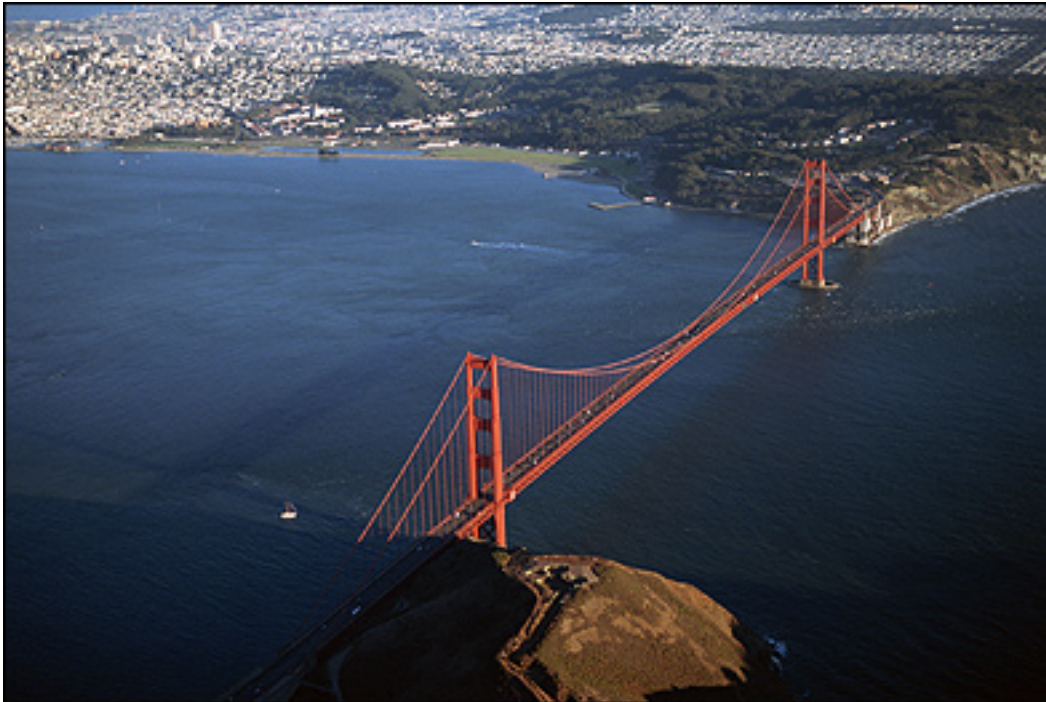
SAVE THE DATE- May 7th and 8th 2007 for IFIP's Annual Conference. Linking Circles VI will take place at Levi Strauss Foundation in beautiful San Francisco.