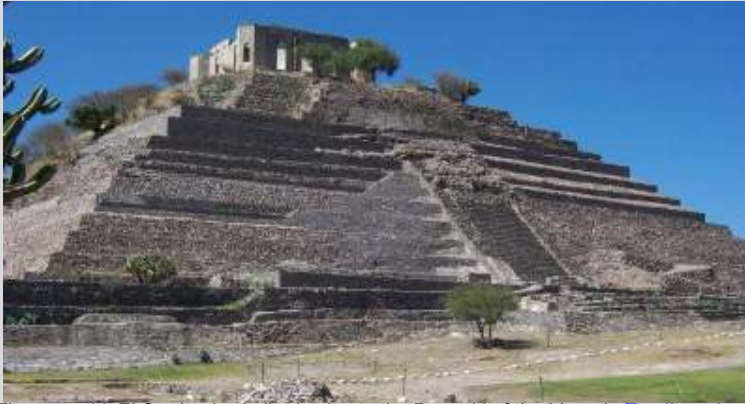
The pyramid, El Cerrito, is similar in size to the Pyramid of the Moon in Teotihuacán . A visit to El Cerrito along with a Friendship Ceremony with the local Otomi people will be part of the agenda. Additional optional site visits include; Sierra Gorda , Amealco , El Bothe , Cadereyta and Oaxaca .