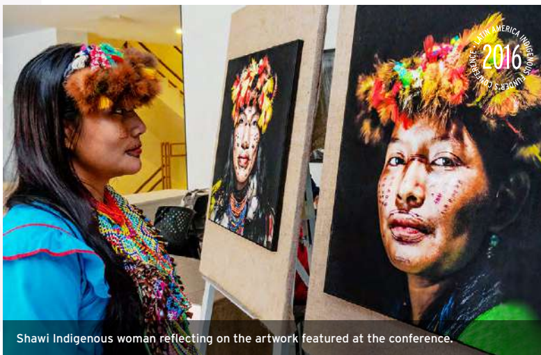
Shawi Indigenous woman reflecting on the artwork featured at the conference.

Each day participants (a group consisting of donors, Indigenous leaders, and environmentalists) learned about the decades-long struggles of these communities to protect their land from such invasions as illegal loggers and palm oil industries. In each community, the group was warmly welcomed by Shipibo families with traditional songs.