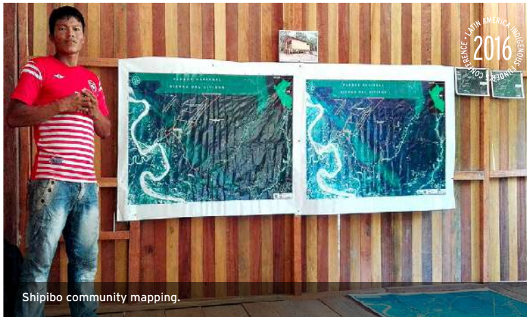
Shipibo community mapping.

In Santa Clara de Uchunya, the visitors were introduced to the community's struggle against a multinational palm oil conglomerate, the Melka family.