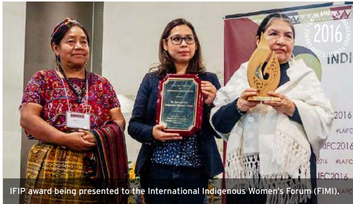
FIP award being presented to the International Indigenous Women's Forum (FIMI)

Suggestions included: Train Indigenous women on such issues as land rights and business strategy; support women's research in their communities; provide materials in their languages, and promote solidarity among Indigenous women at all levels, from the grassroots to international.